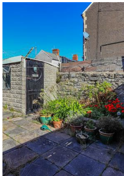
George Street, Barry, CF63 4NL