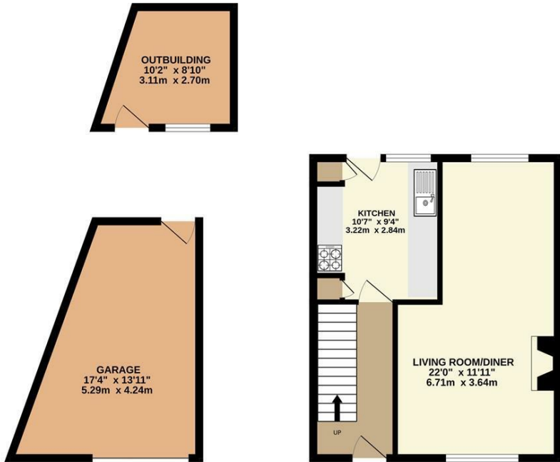
GROUND FLOOR 653 sq.ft. (60.7 sq.m.) approx.