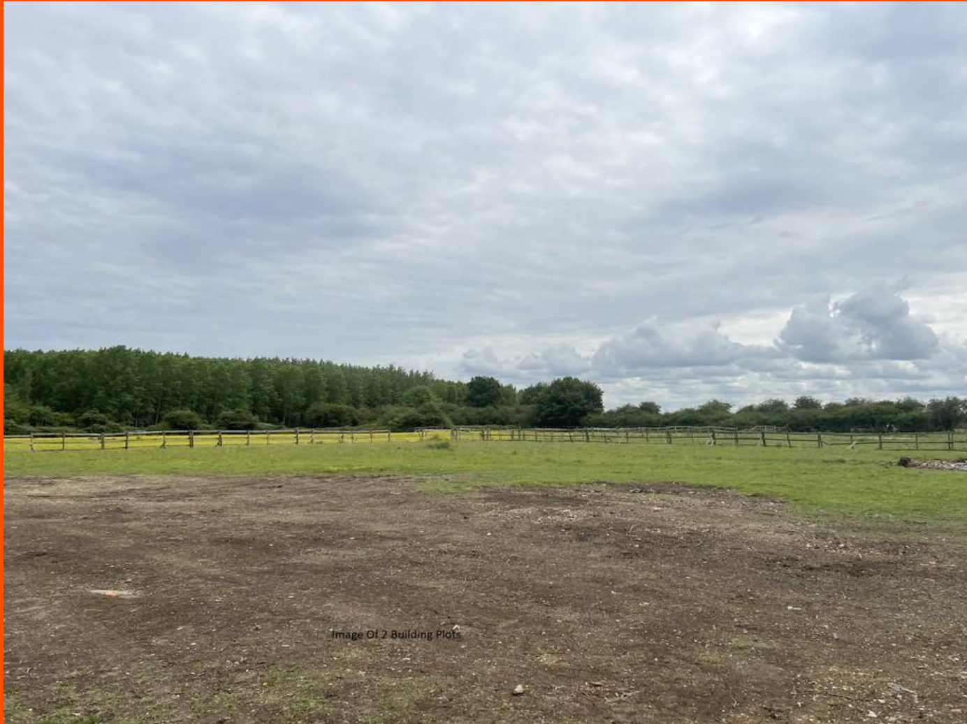
Image Of 2 Building Plots