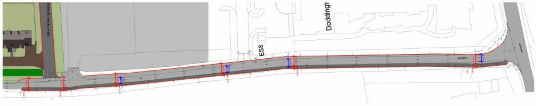
Proposed Highway Works