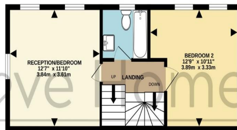
1ST FLOOR 373 sq.ft. (34.6 sq.m.) approx.