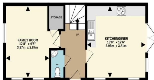
GROUND FLOOR 373 sq.ft. (34.6 sq.m.) approx.