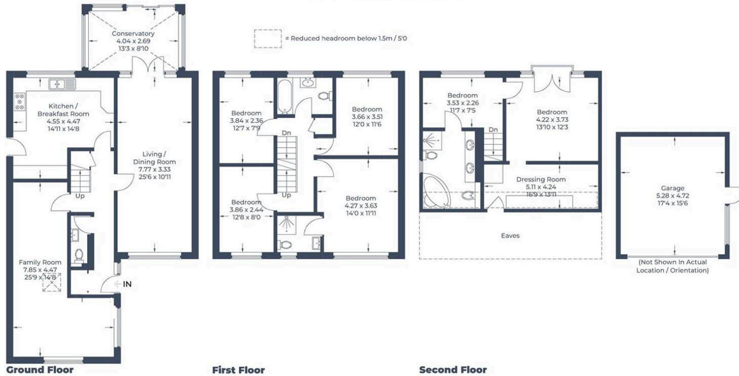
Illustration for identification purposes only, measurements are approximate, not to scale. © CJ Property Marketing Produced for Chandlers