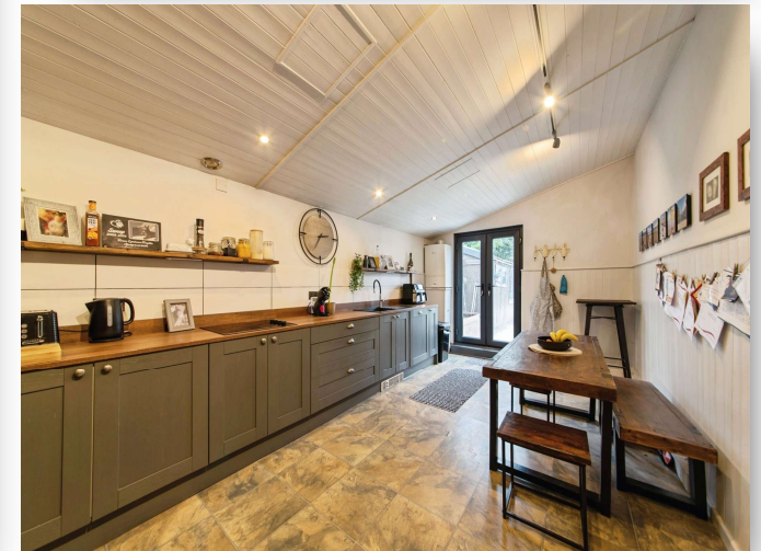
High Street, Martin Lincoln LN4 3QT