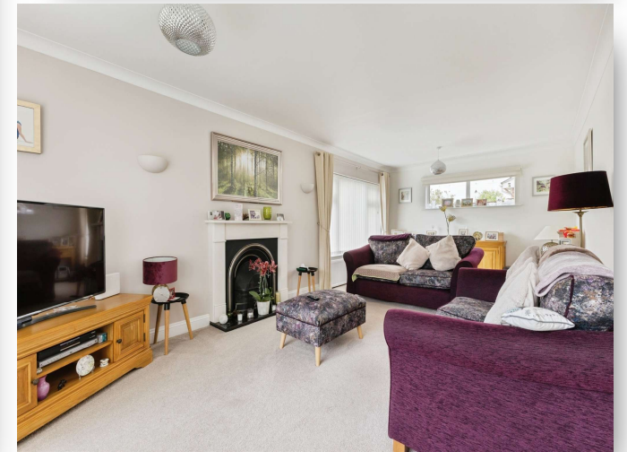
Oaklands, Old Buckenham, Attleborough NR17 1SA