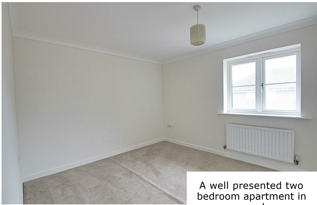
A well presented two bedroom apartment in a popular development.