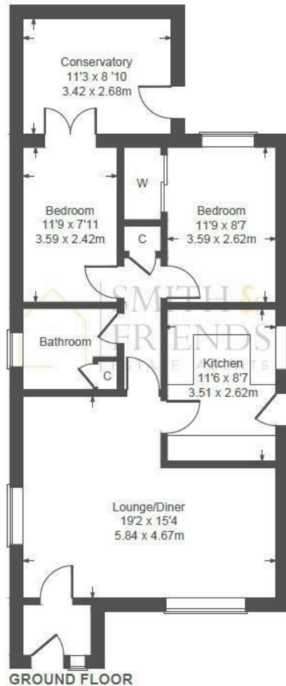
GROUND FLOOR Not to Scale. Produced by The Plan Portal 2024 For Illustrative Purposes Only.

Approximate Gross Internal Area 786 sq ft - 73 sq m