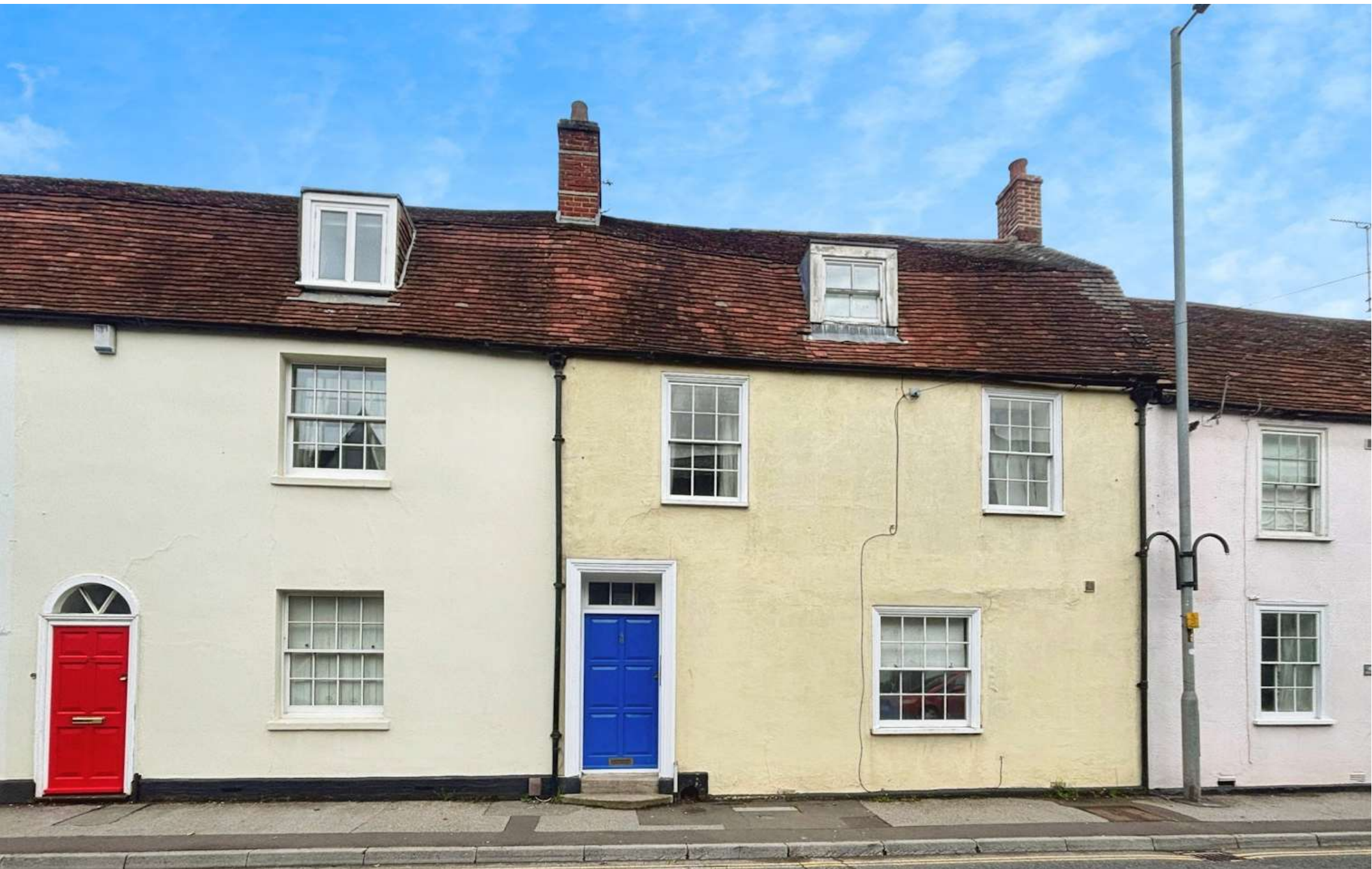
Silver Street, Warminster