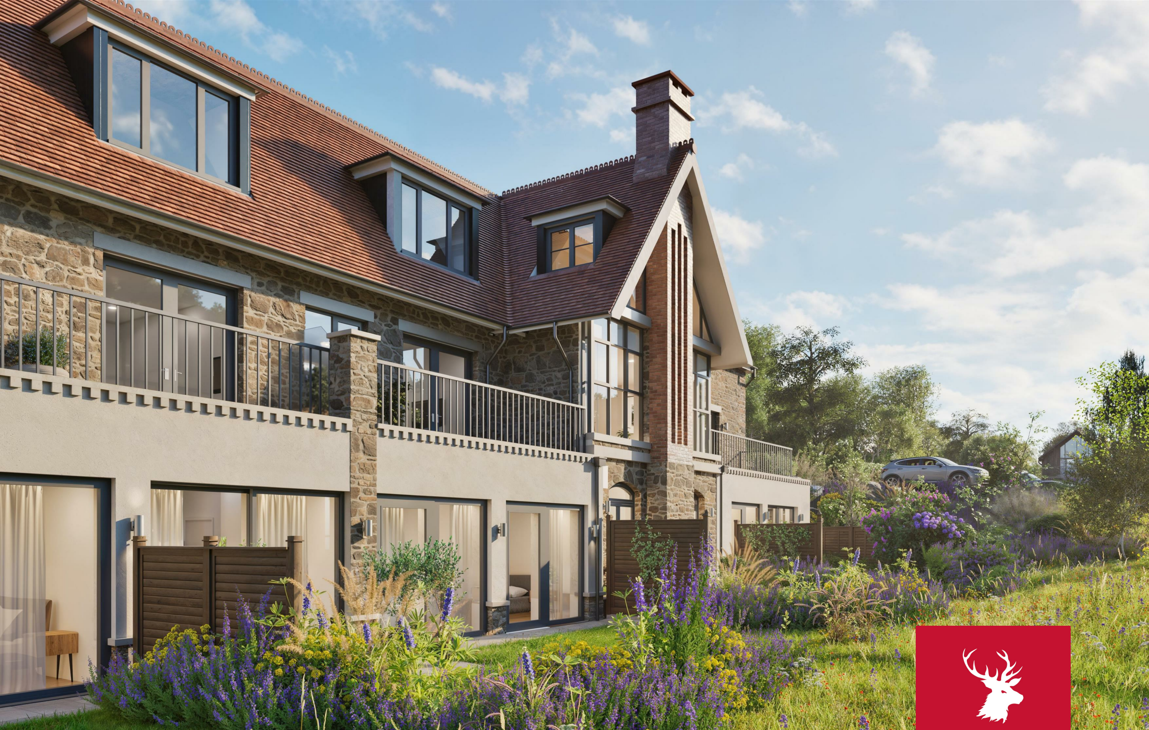
Apartment 12, Lee Bay Gardens