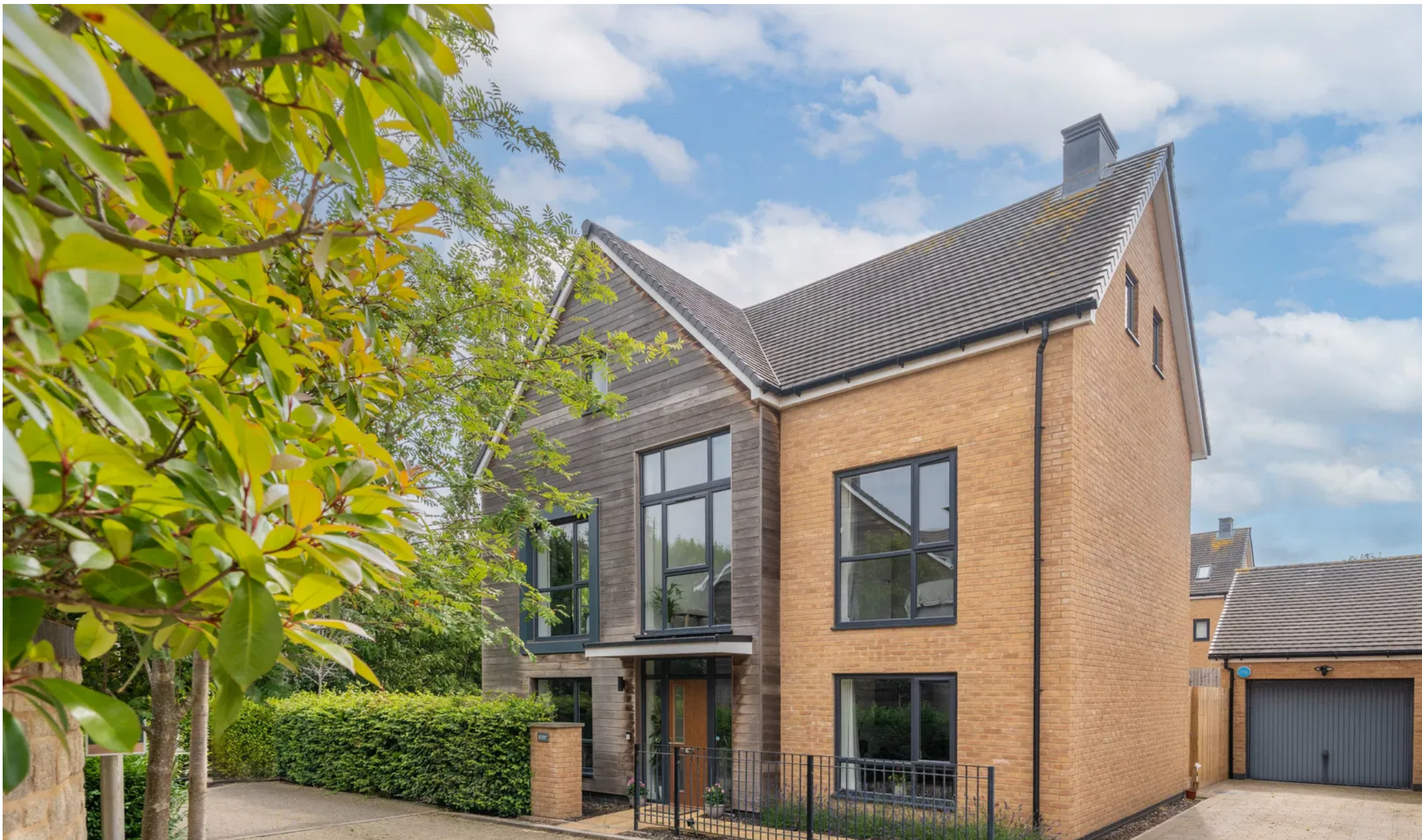
Ormrod Grove, Locking £580,000