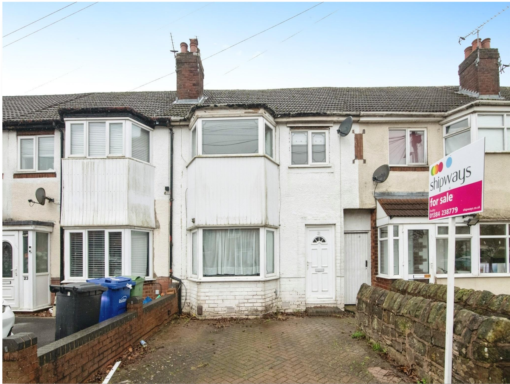
Castle Street, Sedgley Dudley DY3 1NU