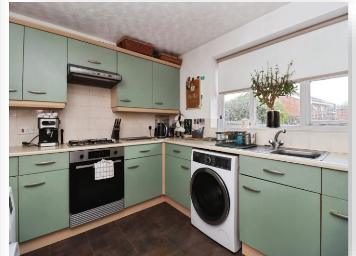
Harwood Drive, Kettering NN16 9FD