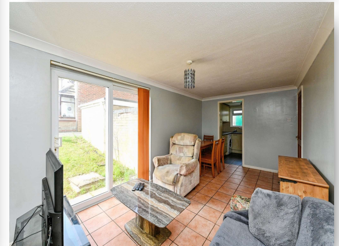
Wellington House, Glebe Road, Downham Market, PE38 9QN