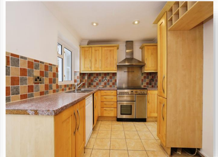
29 Pinckneys Way, Durrington Salisbury SP4 8BT