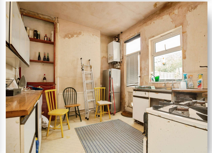
Prince Leopold Street,Adamsdown Cardiff CF24 0HT