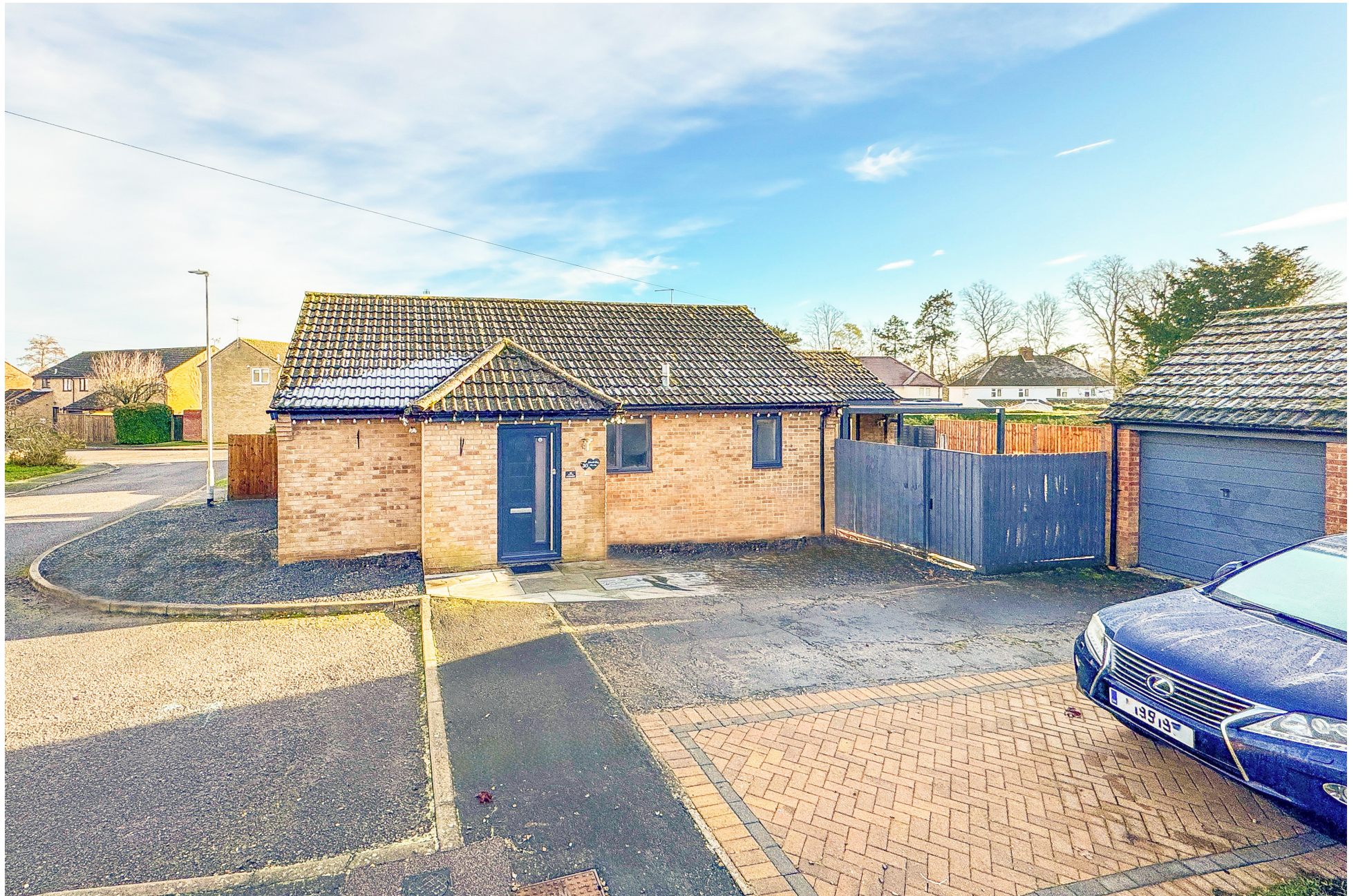
Icknield Close, Cheveley, Newmarket, Suffolk