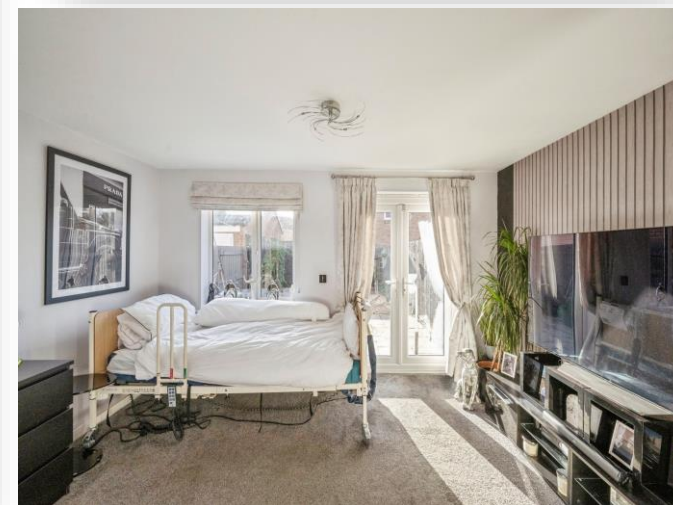
West Moor Croft, Goldthorpe Rotherham S63 9FL