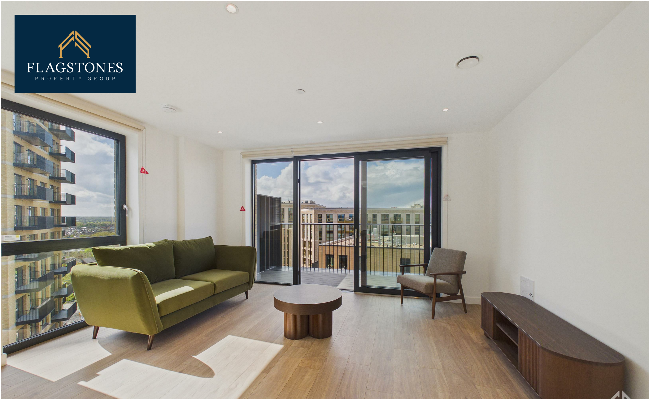
5 Manser House 36 Capital Interchange Way, Brentford, TW8 0XP £2,600