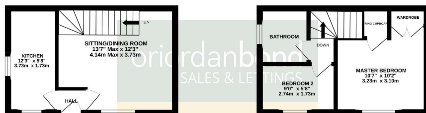
1ST FLOOR 238 sq.ft. (22.1 sq.m.) approx.

TOTAL FLOOR AREA: 475 sq.ft. (44.2 sq.m.) approx.