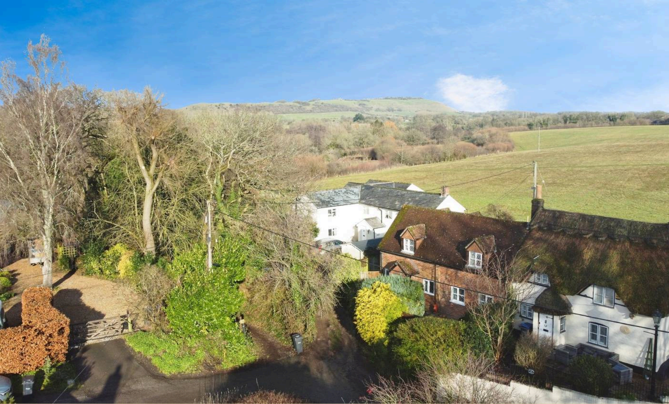
Knowle Cottage, Knowle £365,000