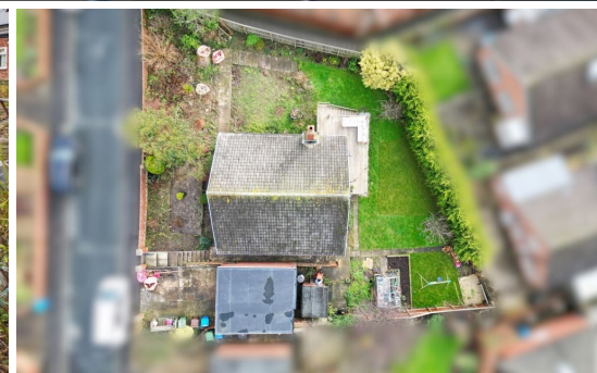
4 NEWLANDS AVENUE, WHITBY- 3 bed Detached Bungalow -£385,000