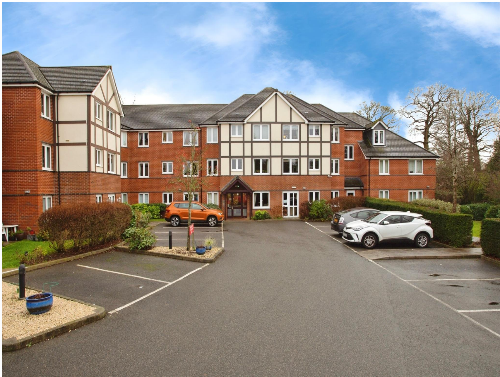
Nanterre Court, Hempstead Road, Watford, WD17 3AF