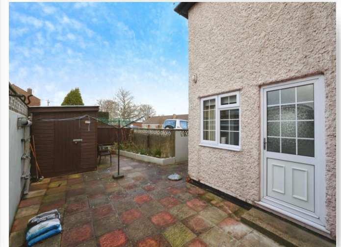
15 Larkhill Road, Durrington Salisbury SP4 8DR