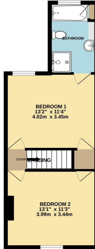
TOTAL FLOOR AREA: 822 sq.ft. (76.4 sq.m.) approx. Made with Metropix ©2026