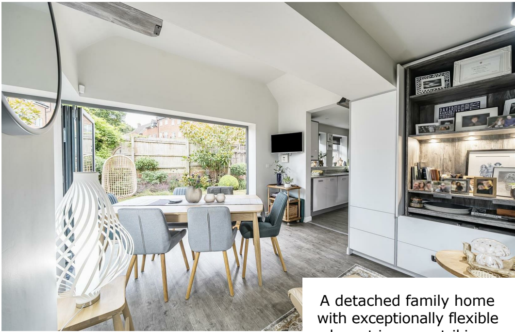
A detached family home with exceptionally flexible layout in easy striking distance to road and rail links.