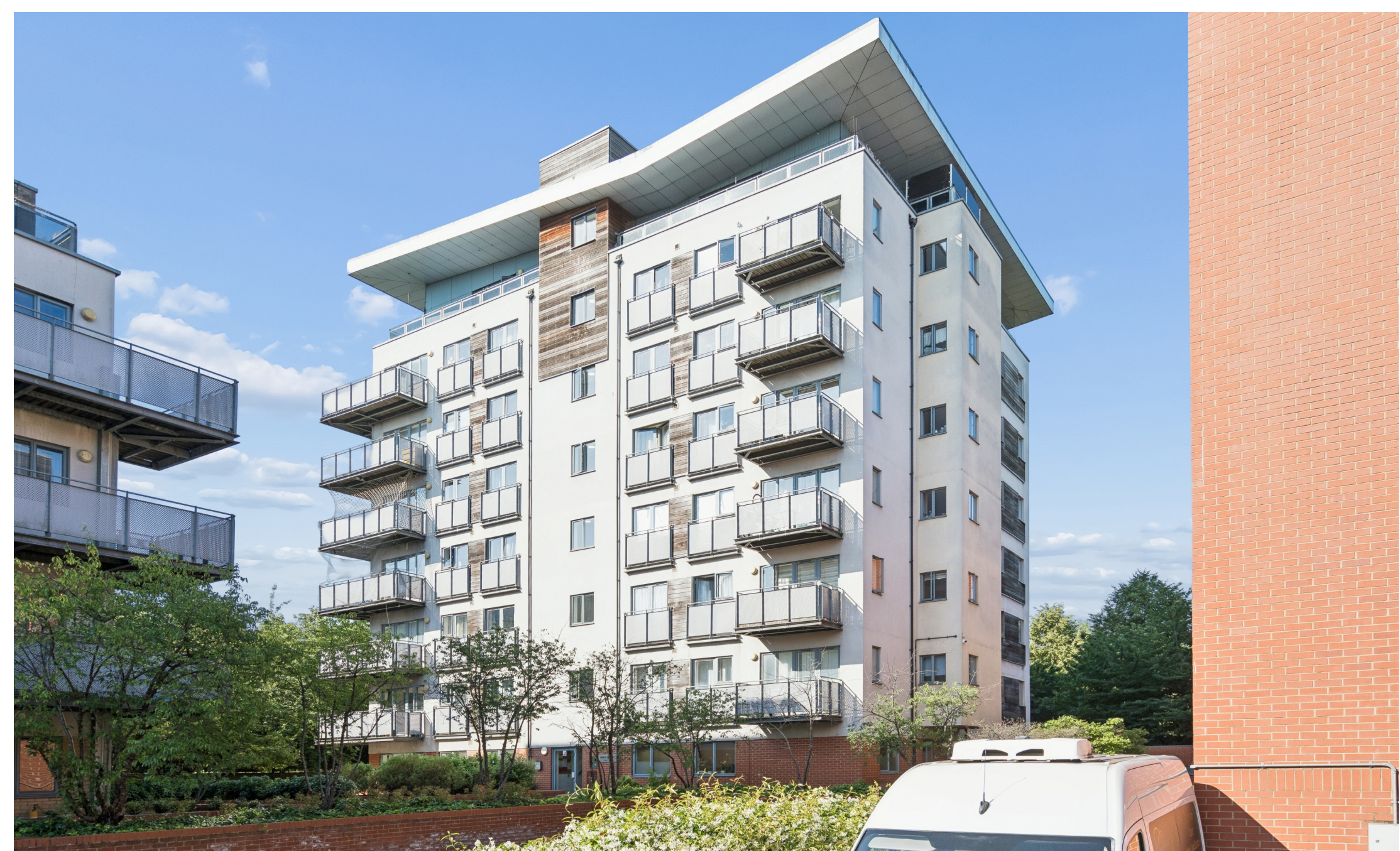
A modern one bedroom sixth floor spacious apartment with a private balcony Aqua House, Agate Close, Acton NW10 7FF