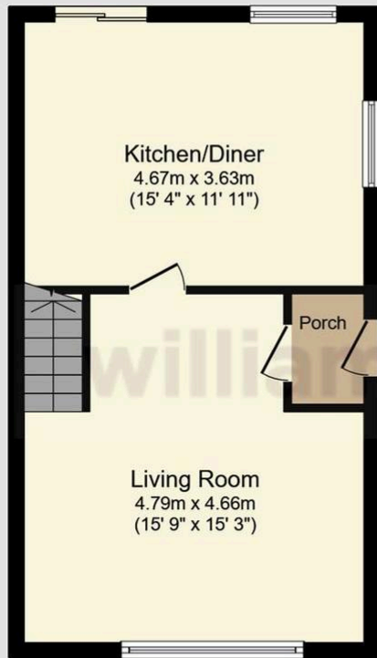
Ground Floor Floor area 39.8 sq.m. (428 sq.ft.)