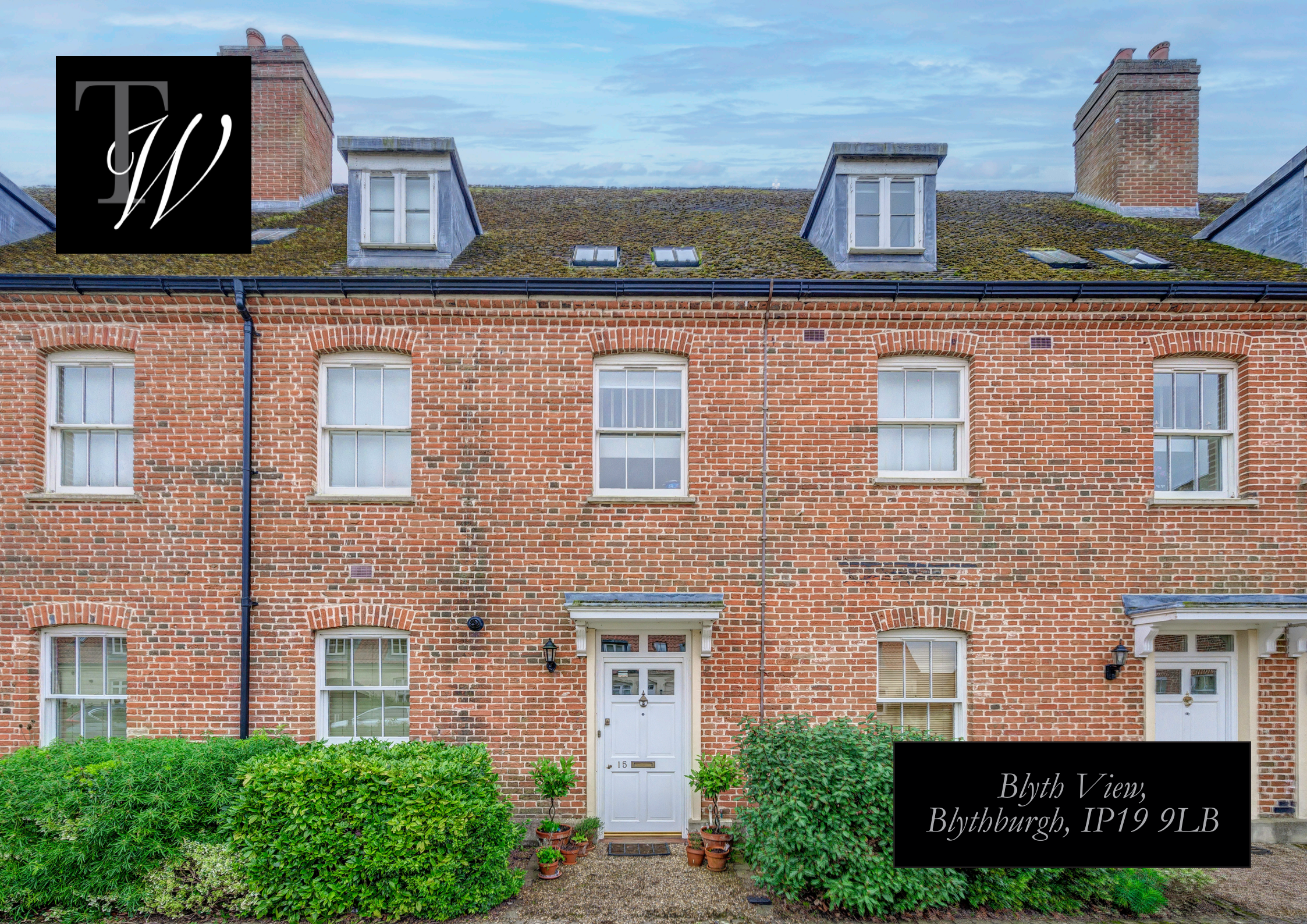
Blyth View, Blythburgh, IP19 9LB