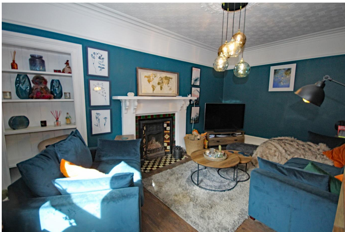
Sitting Room 4.98 m x 3.32 m Front facing window. Substantial wooden fire surround, recessed fireplace with wood burning stove set on a tiled

hearth. Recessed alcove with double cupboard fitted below. Doors to the kitchen and the dining room/bedroom 3.