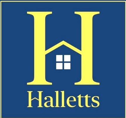
124 Paddock Road Newbury Berkshire RG14 7DH