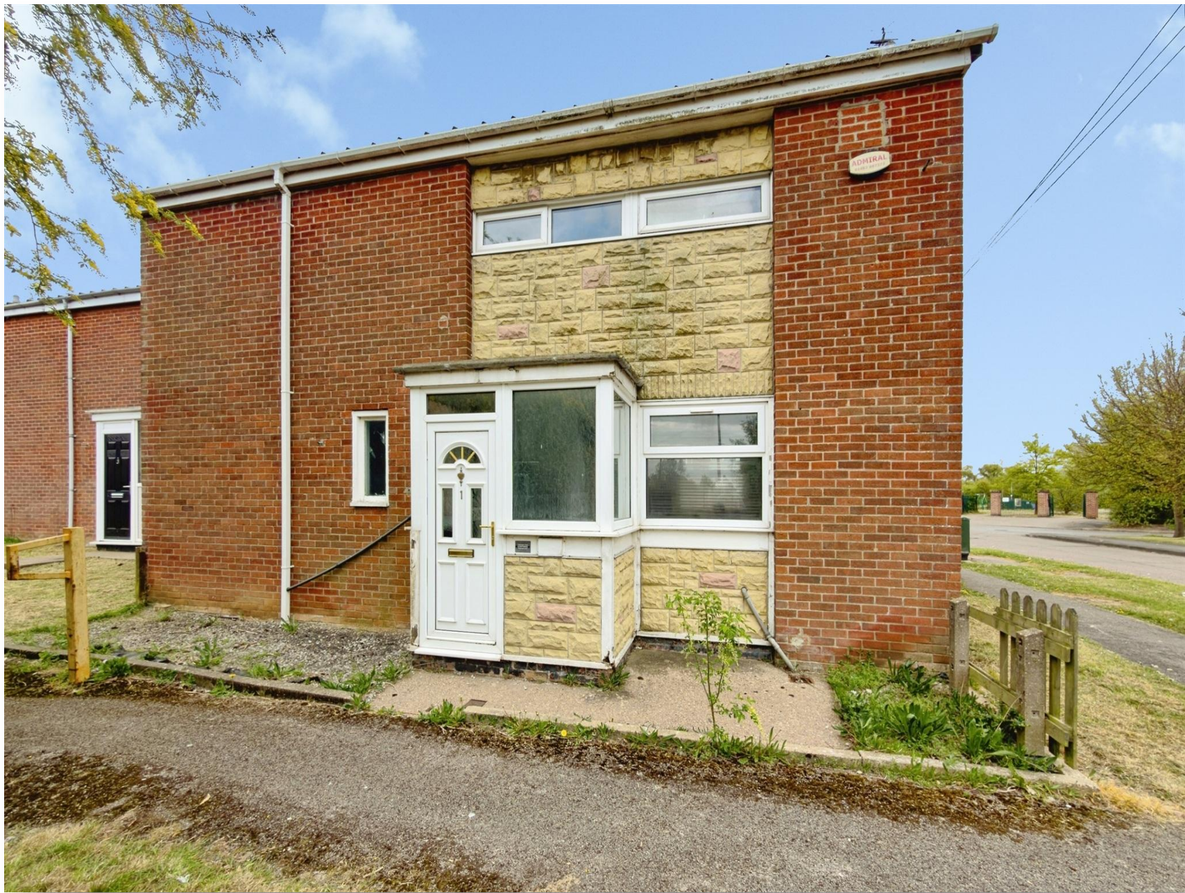
Bossington Close, Bransholme, Hull, HU7 4HU