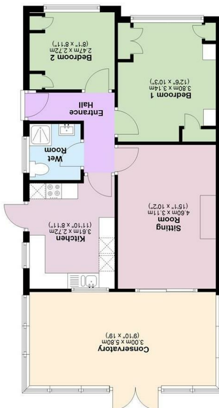
Ground Floor Approx. 69.4 sq. metres (747.3 sq. feet)

Total area: approx. 69.4 sq. metres (747.3 sq. feet)