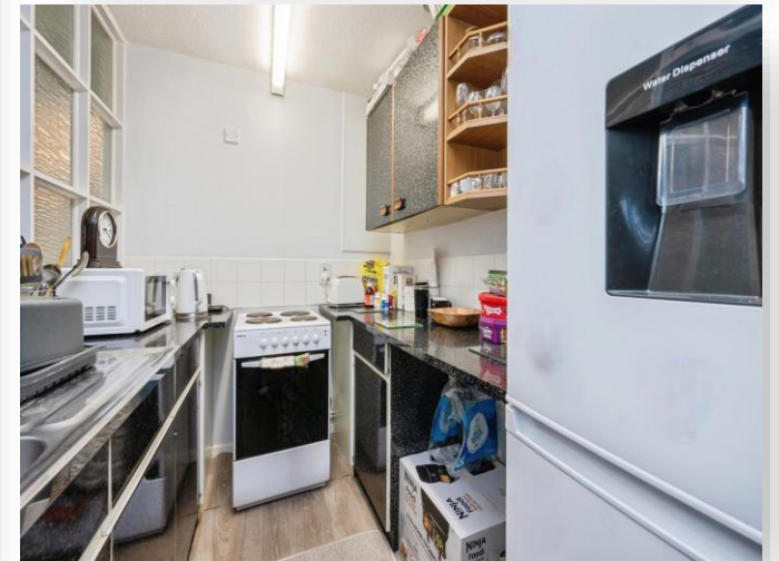
Watling Court, Bedford Road, Houghton Regis, Dunstable, LU5 5QS