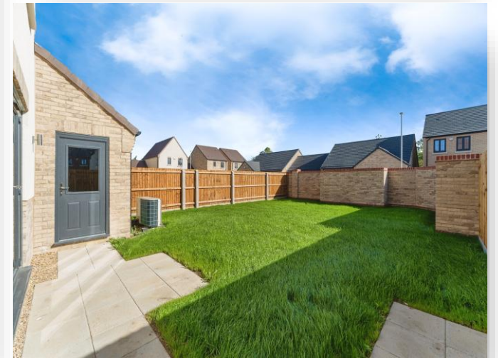
Plot 4, The Osiers, Edwards Way, Manea PE15 0HY