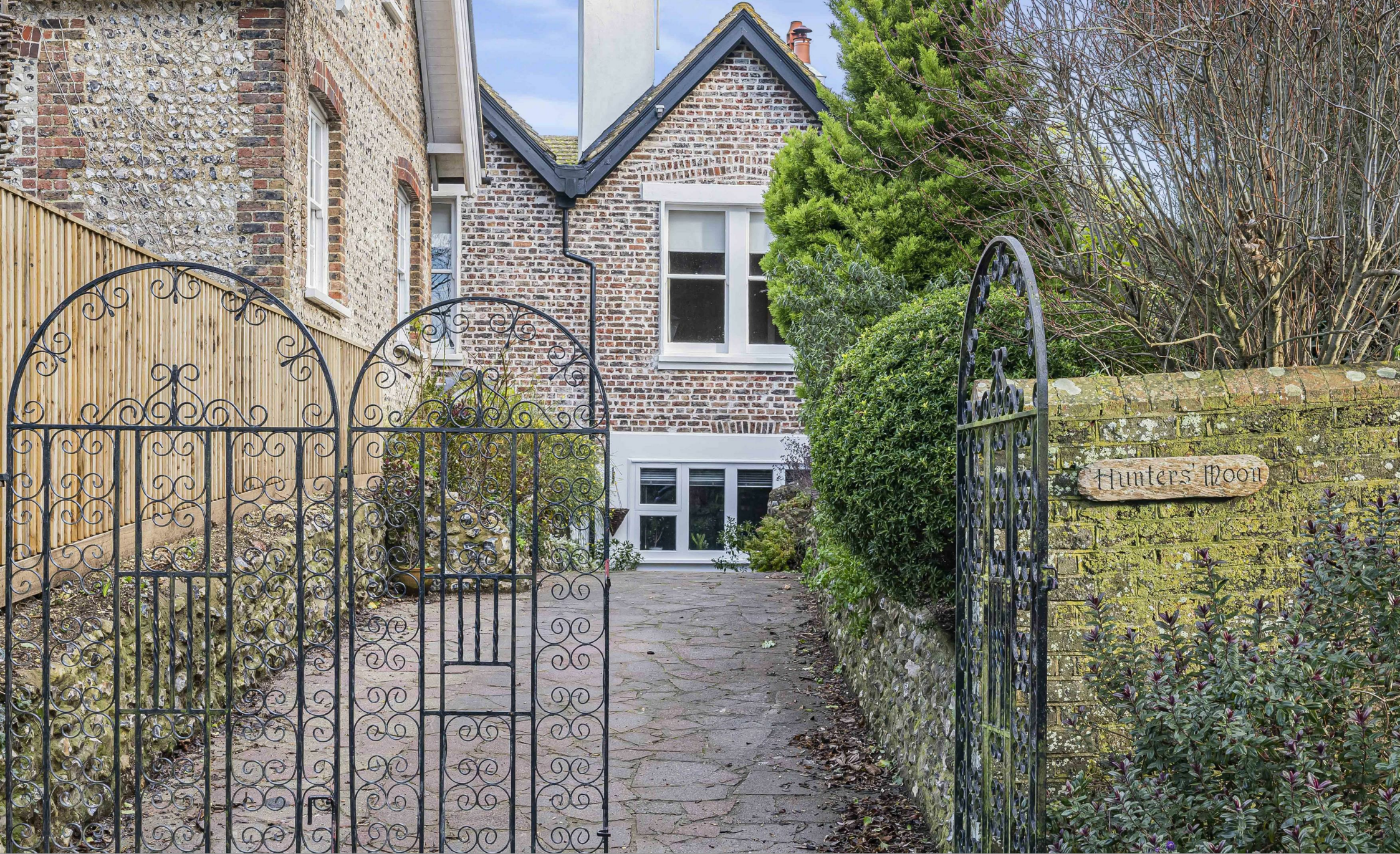
Hunters Moon Norton, Seaford, BN25 2UR