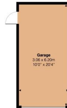
Garage Approx 204 sq. ft / 19 sq. m (Not Shown In Correct Location / Orientation)