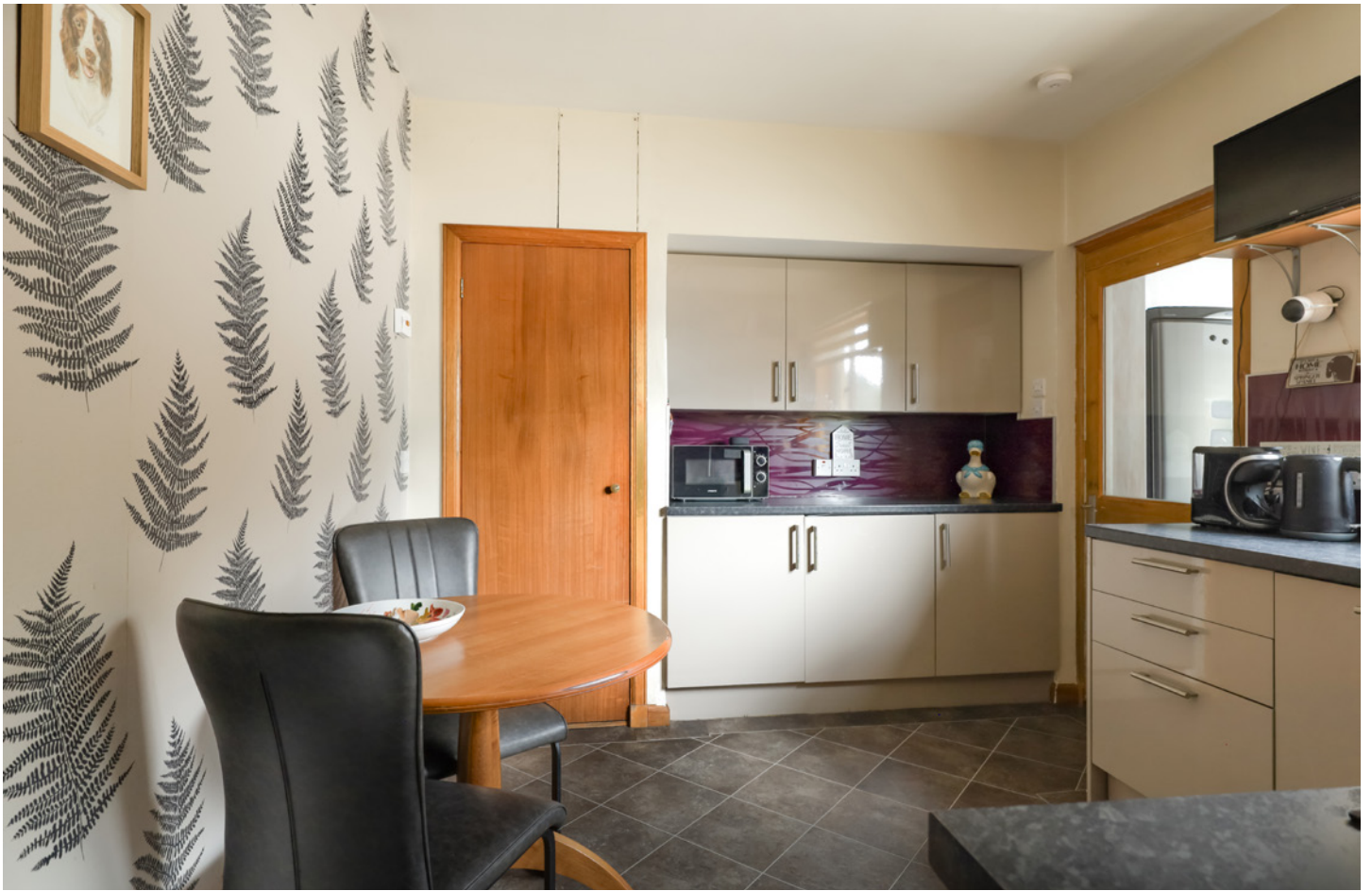
A recently installed dining kitchen with multiple wall and base-mounted units with integrated utilities. A separate utility room off the dining kitchen, which has access to the garden.