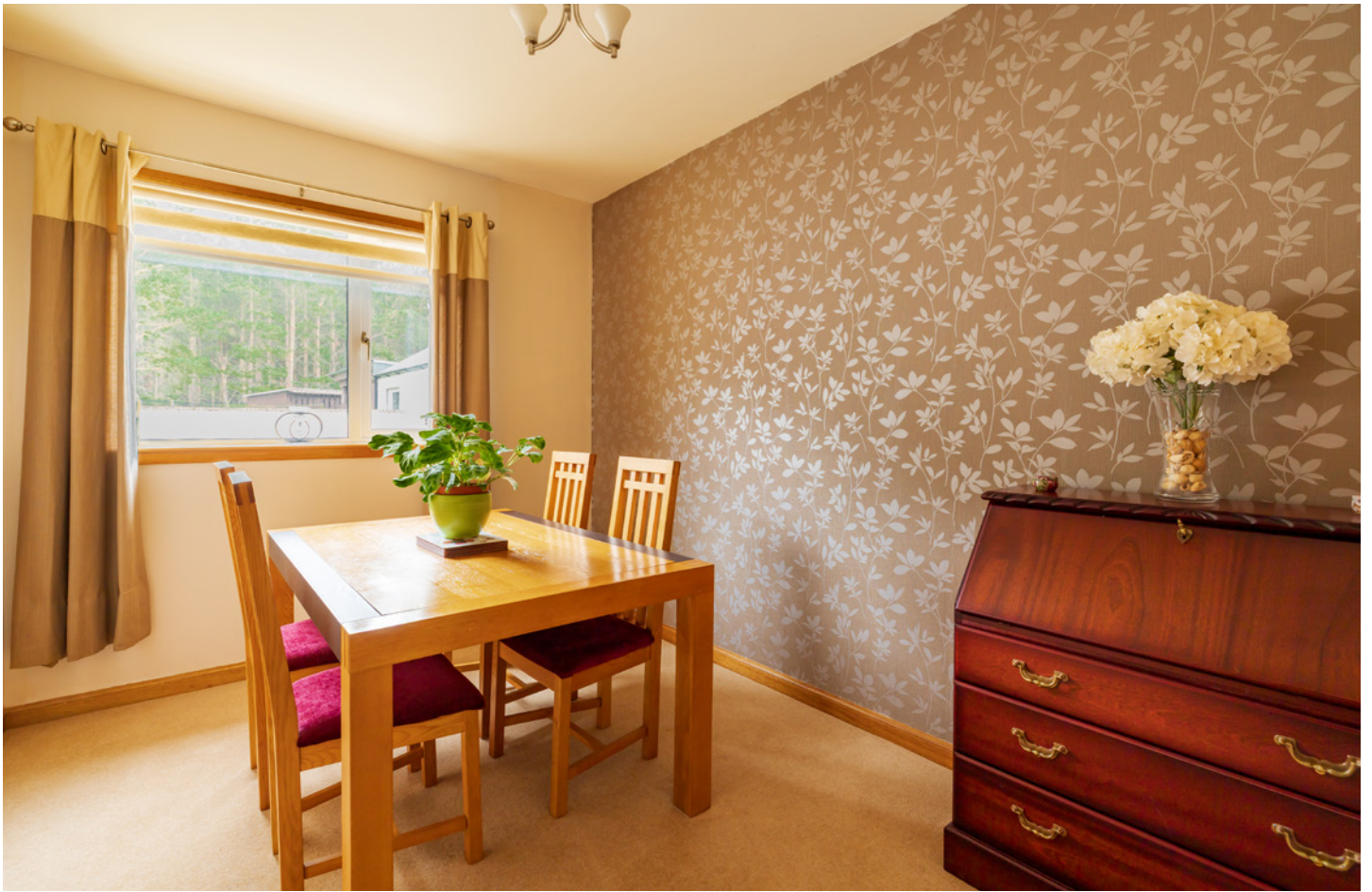
A formal dining room/third bedroom and a modern 3-piece family bathroom complete the ground-floor accommodation.