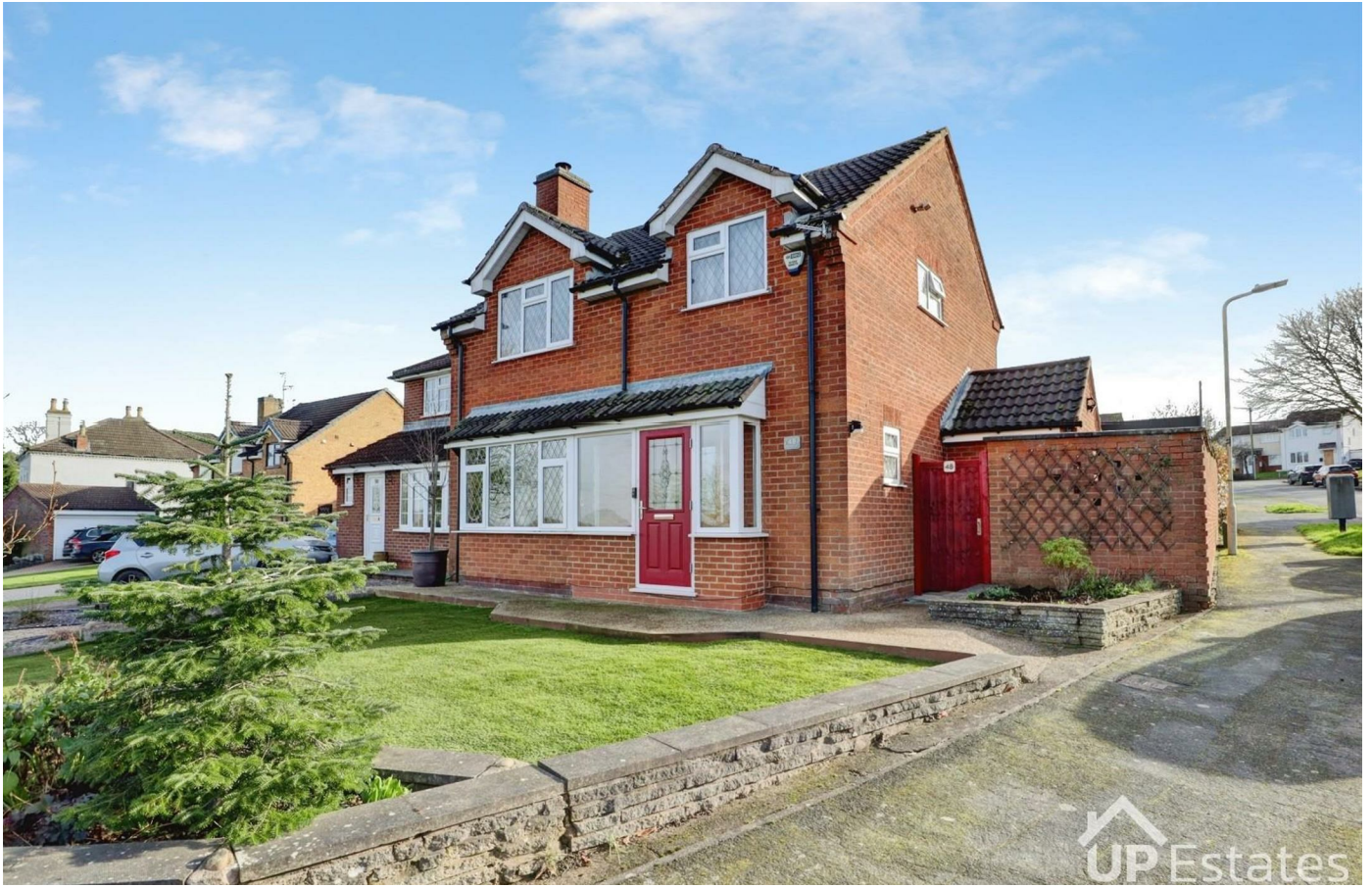
Thurlaston Lane, Earl Shilton