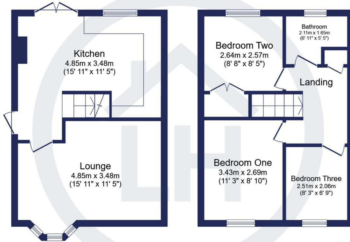
Ground Floor Floor area 34.7 sq.m. (374 sq.ft.)