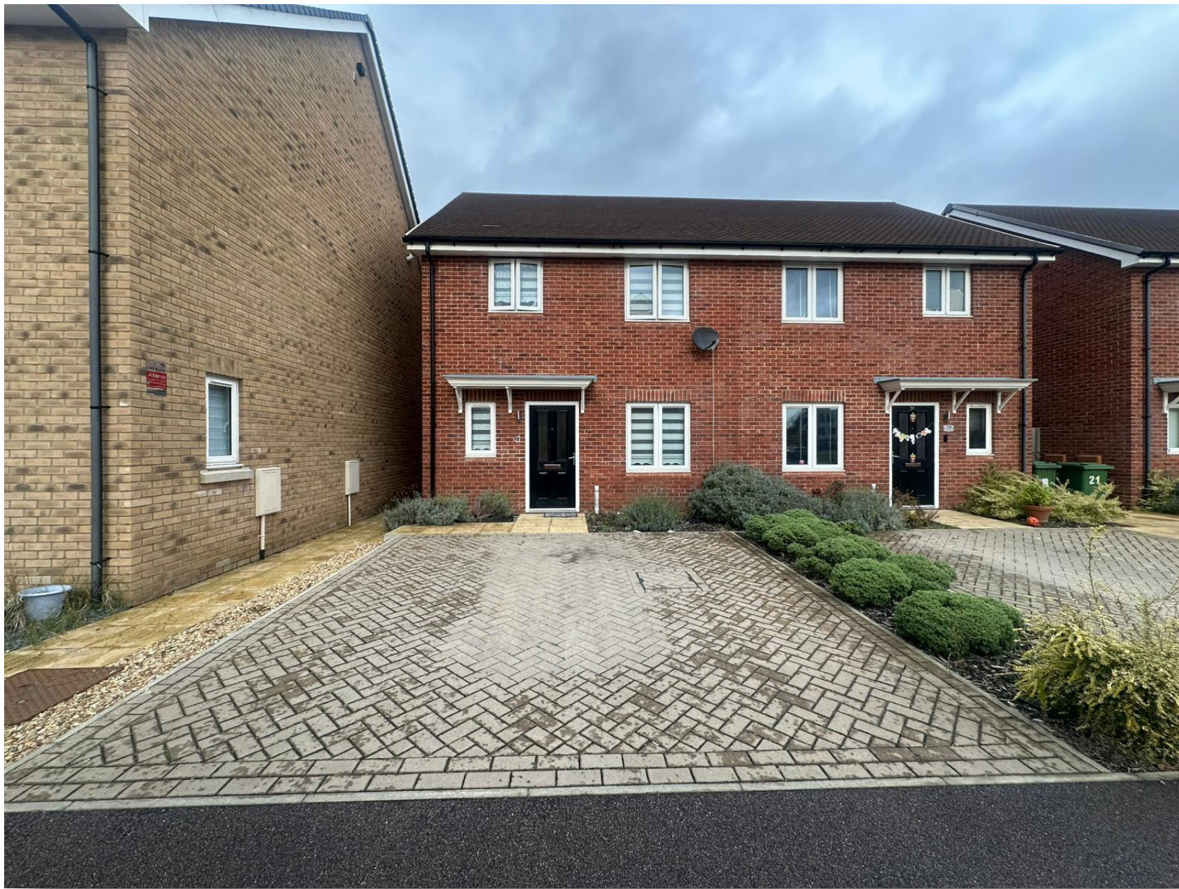
Waterfield Close, Peterborough PE3 6AS