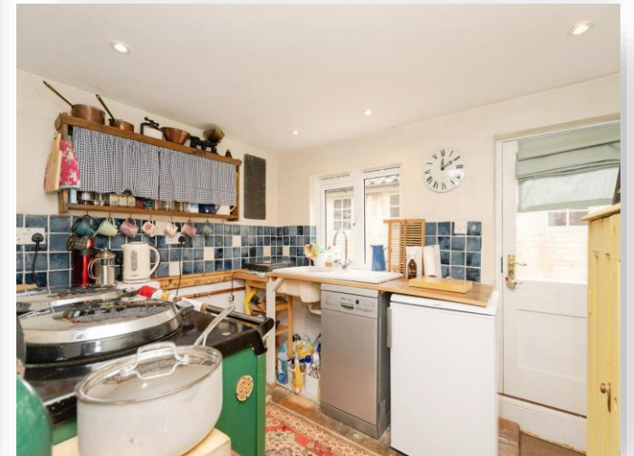
Great Yard, Saxthorpe Norwich NR11 7AH