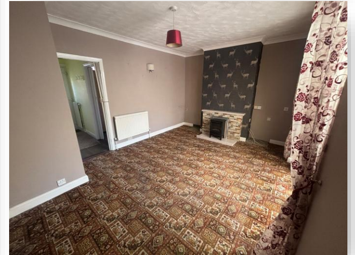
South Hill Road, Norwich NR7 0PQ