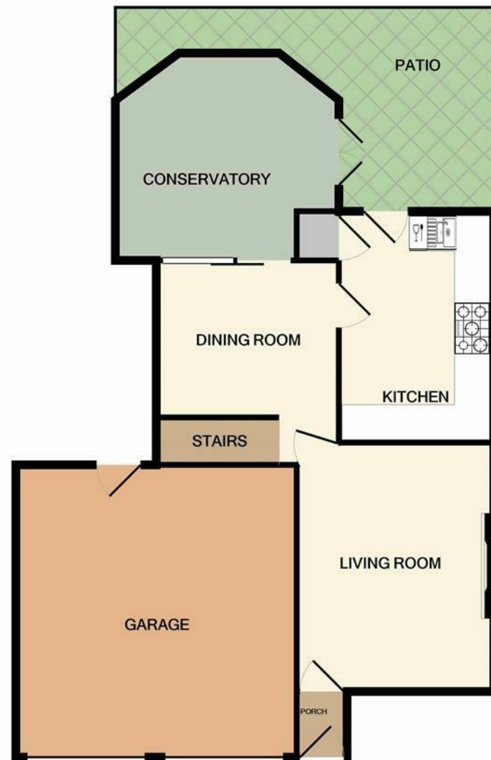
GROUND FLOOR APPROX. FLOOR AREA 786 SQ.FT. (73.0 SQ.M.)