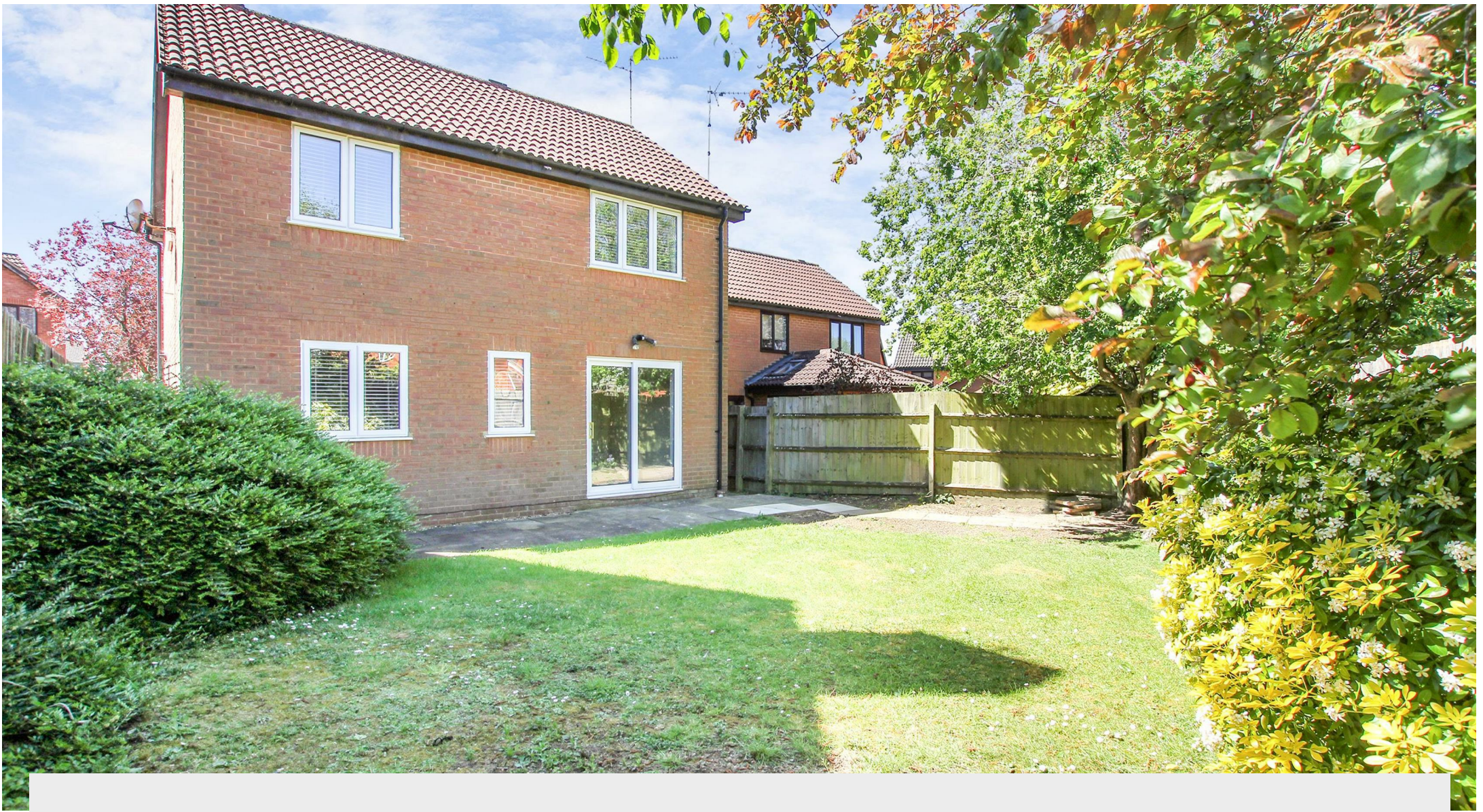
Enclosed Rear Garden.