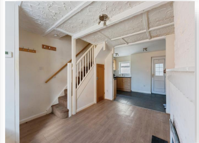
Mona Street, Cloughton, Birkenhead, CH41 0ED