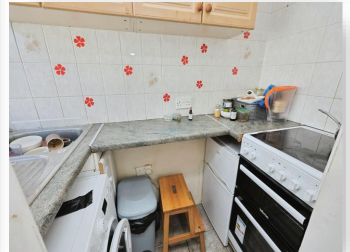
Mandells Court, Norwich, NR3 1AY