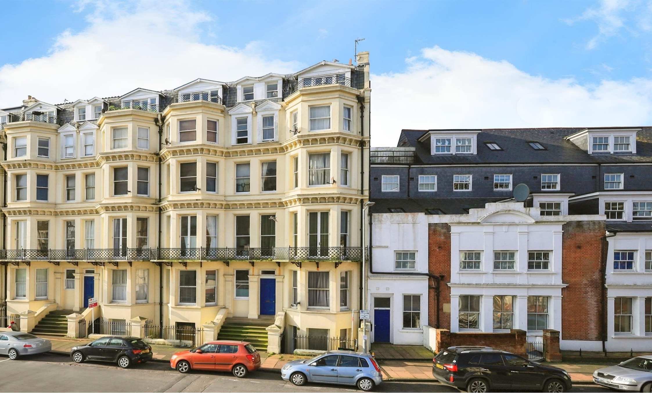
Queens Gardens, Eastbourne BN21 3EF