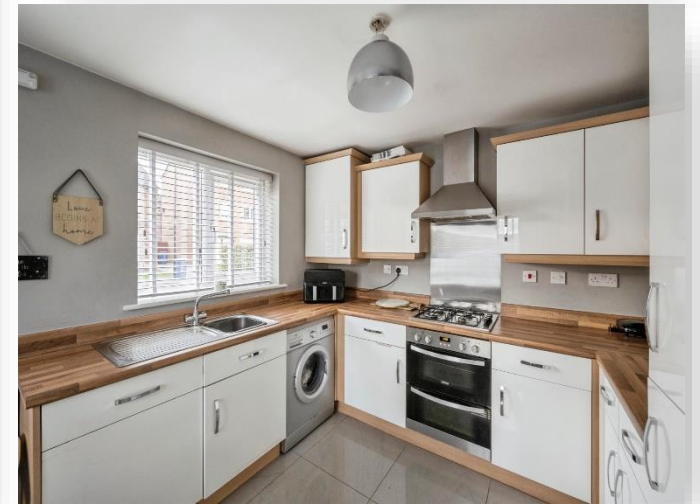
Falcon Close, Mexborough S64 0NU